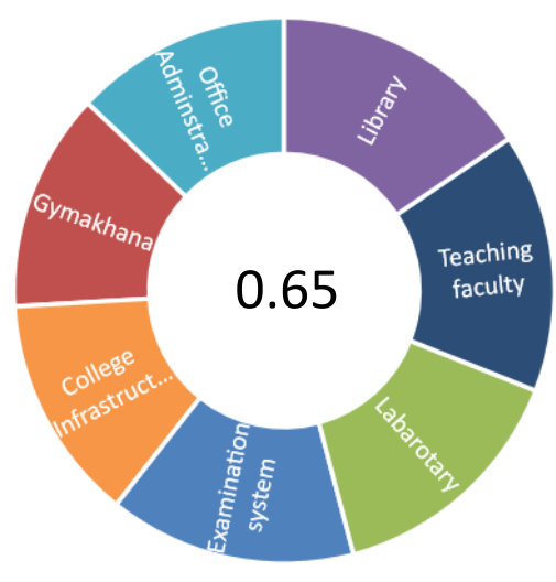
Student Satisfaction Index