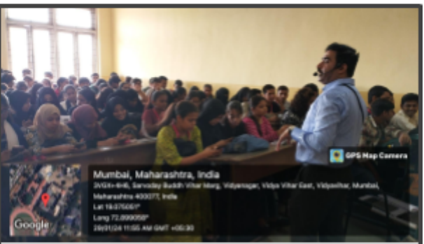
Awareness about NEP